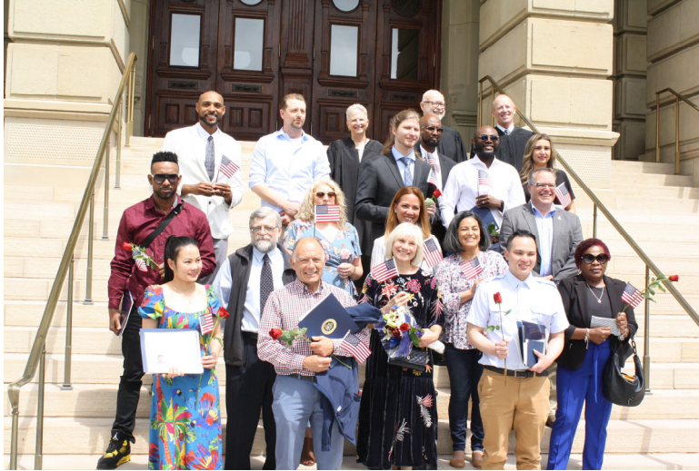
Newly Naturalized citizens from Naturalization Ceremony held on July 10, 2023 in Cheyenne.