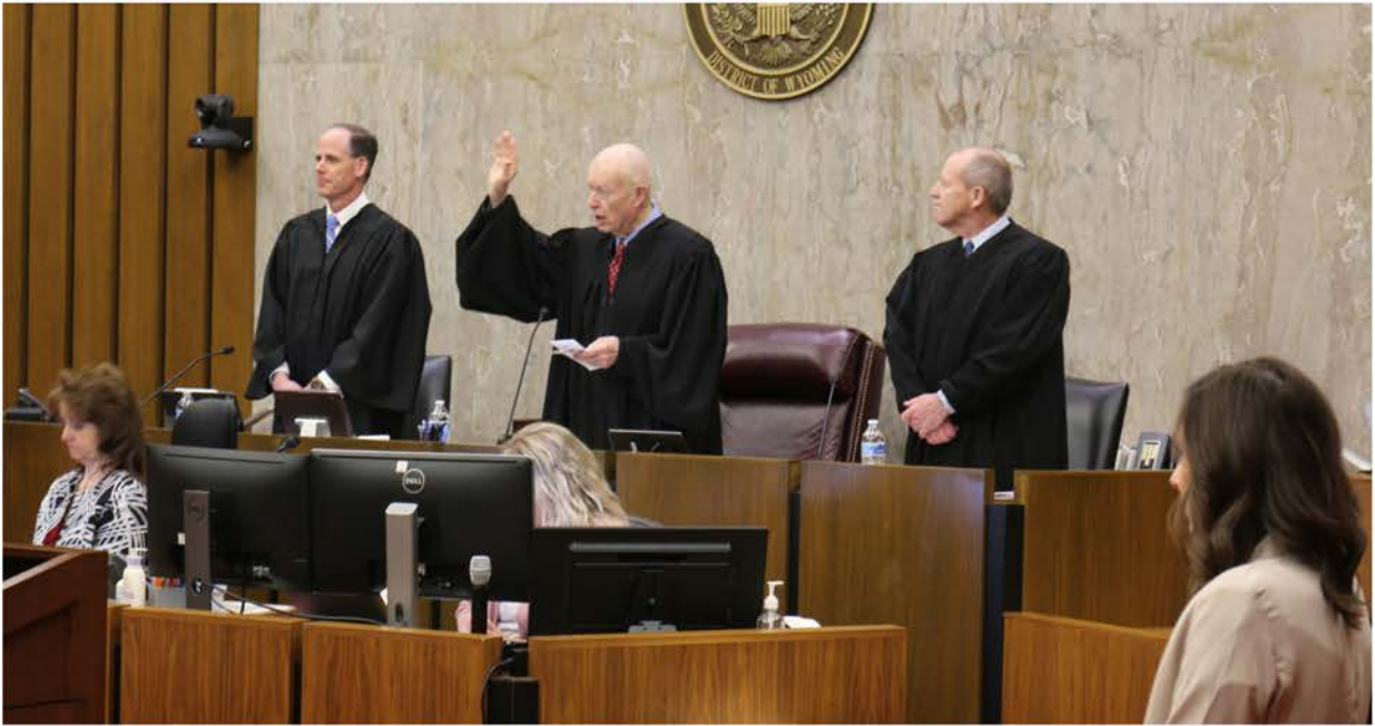
Naturalization Ceremony on March 11, 2025