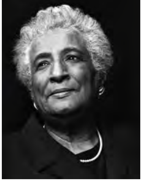
1998 Portrait of Constance Baker Motley

these stories and more, visit https://www.uscourts.gov/judici ary-news